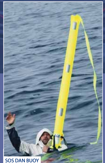
SOS DAN BUOY